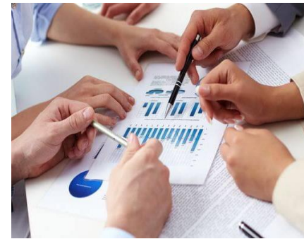
Shared business file

Workspace of trade actors. Provide information. Enables collaborations. Supports business transactions online.